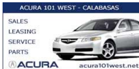
FEATURE BANNER (242 x 120 pixels)